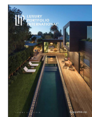
Luxury Portfolio Magazine